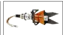
ICU 10 A 40