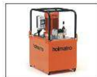
Electric-powered vari pump with protection frame (50 litre tank)