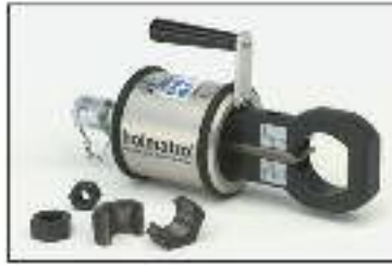
HNC 3250 U