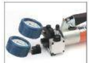
M 306 + A 500