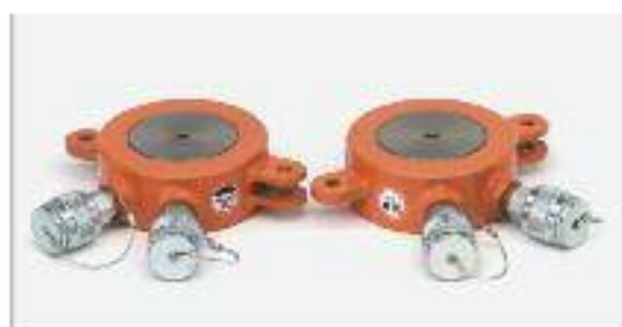
HY 100 G 1 U