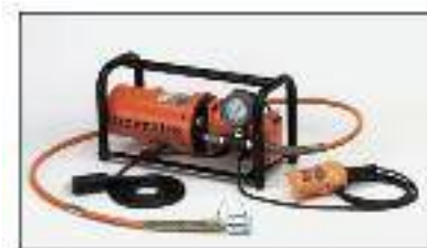
EHW 1650 R RC + pressure gauge (option 2) + hydraulic hose