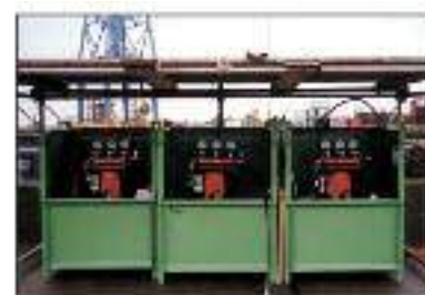
Vari-pumps in use with Stena Line