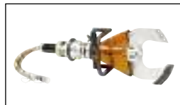
ICU 10 A 10