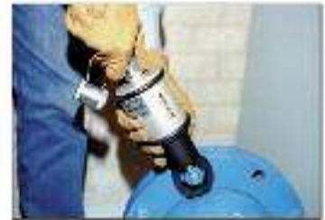
Nut cracker model HNC 1536 NU in use