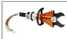
ICU 5 A 70