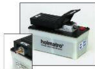
AHS 1400 FS with compressed air connector