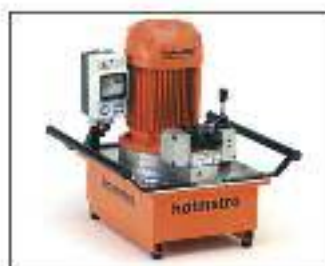
Electric-powered vari pump with carrying frame (6 litre tank)