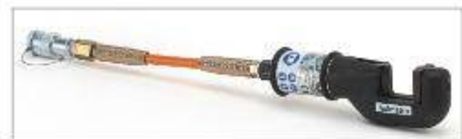
Mini-Cutter HMC 8 U