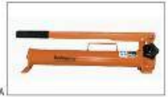
HTS 550 A