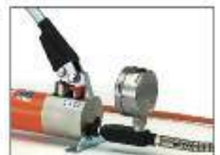
M 108 + A 500