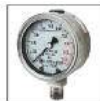
Pressure gauge A 500