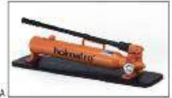
HTW 2200 A