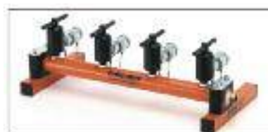
SMV 4 manifold with optional couplers